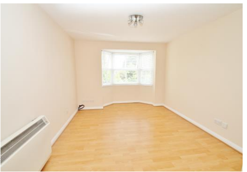
Leigh-On-Sea Monthly Rental Of £800.00